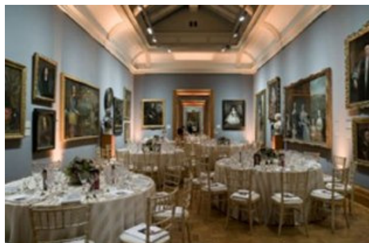
Table Talk were thrilled to be catering at the launch of the NEW Irving Penn Exhibition at the National Portrait Gallery last month. Irving Penn is a distinguished and innovative photographer, known as the ' emperor of understated glamour '. Over 400 guests came to browse his magnificent work, which included over 120 of his acclaimed portraits. The canapé menu featured some of our new spring & summer recipes including Fourme d'Ambert with Sauterne jelly on a rosemary sablé and Cornish crab mousse with smoked salmon powder , avruga caviar and sour cream.