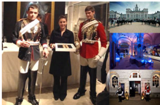
Our first of many events at the Household Cavalry...