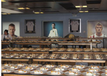
Chefs Salad of Artichoke, Winter Vegetables, soft boiled eggs & Truffle dressing

We were thrilled to be involved in the 2009 Sunday Times Sportswoman of the Year Awards Ceremony held at The David Beckham Academy in Greenwich. With 260 distinguished guests attending, it was the first event of that calibre to be held at the academy. Phenomenal individuals from all sporting fields, including Lawrence Dallaglio and Pat Cash , were present to celebrate the incredible achievement of British sportswomen over the year. Chrissie Wellington, world-record holder and Ironman Triathlon took the top honour with world Heptathlon Champion Jessica Ennes as runner up, before the sports-studded guests enjoyed one of Table Talk's seasonal lunches. A light winter salad with artichoke mousse paved the way, followed by steamed halibut fillets with chestnut ravioli and pumpkin purée and a warm chocolate fondant with fragrant Earl Grey ice cream for dessert. It was a remarkable event and a testament to the brilliance of our pastry chef that so many finely toned athletes tucked into the delicious decadent chocolate fondant.