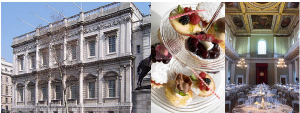
Table Talk served a delicious dinner for 320 guests at Banqueting House . The bespoke menu, designed to be the finale to the World Broadcaster Meeting consisted of glorious fresh trays of sushi followed by a traditional main course of roast beef, served with a surf and turf twist of homemade lobster ravioli, fresh summer peas and asparagus. An array of miniature chocolate and fruity desserts, including an elderflower brûlée, were served on individual cake stands at each table; the perfect way to complete a fabulous dinner and a lengthy day of meetings!